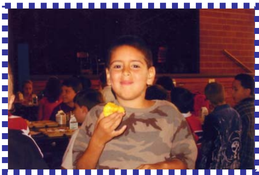
Enjoying RI juicy peaches at a Cranston elementary school

By fall 2009 all of Rhode Island's 36 public school districts and each independent school regularly purchases at least one Rhode Island farm fresh food.