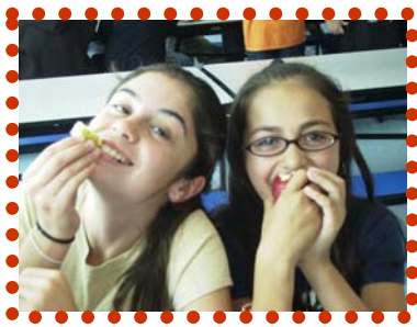
RI potatoes & apples at a Pawtucket Jr. high school

Serving healthy foods in Rhode Island schools is a goal for many. Supporting the local economy and small business owners is a goal for others. This project combines health, business and environmental concerns in a win-win situation.